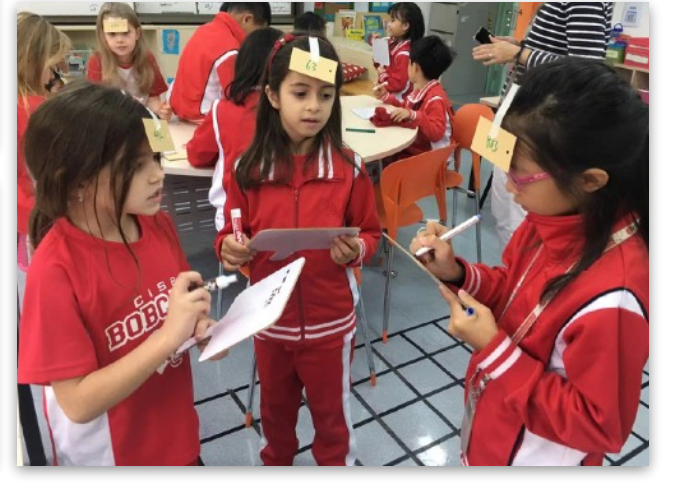
mindfulness - time management - organization Self-management - organization et