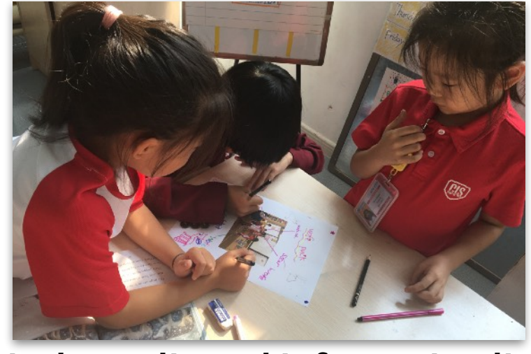
ethical - media and information literacy